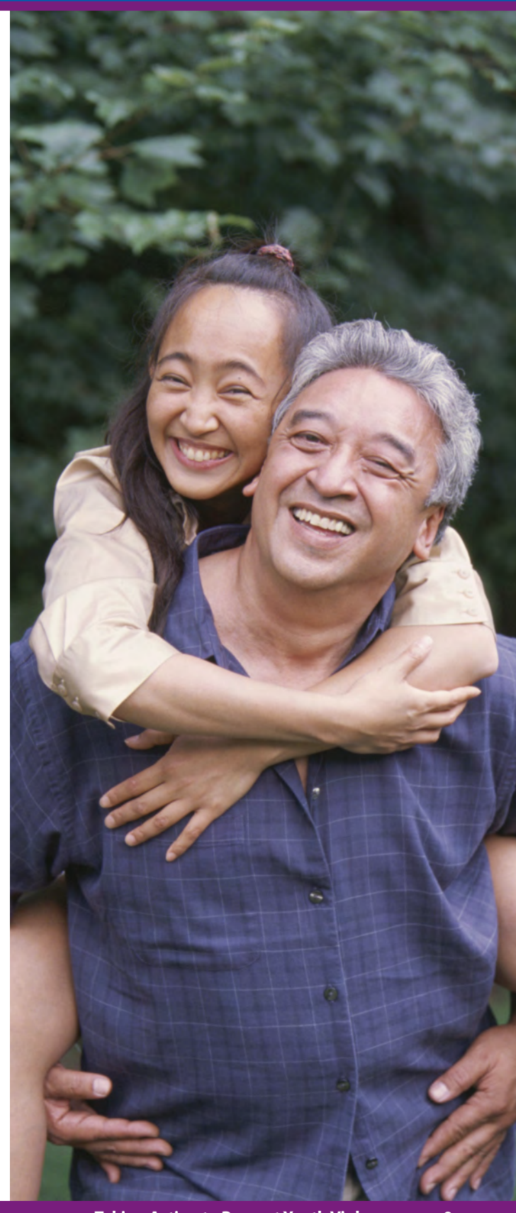
Taking Action to Prevent Youth Violence